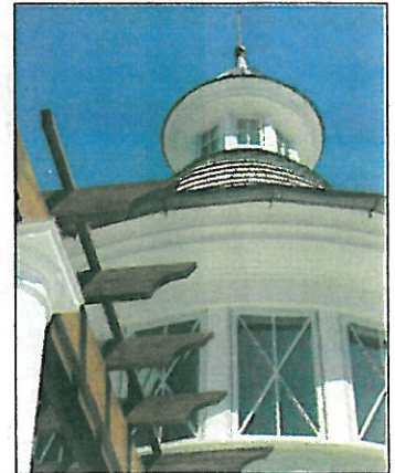
Architectural details are a standout.