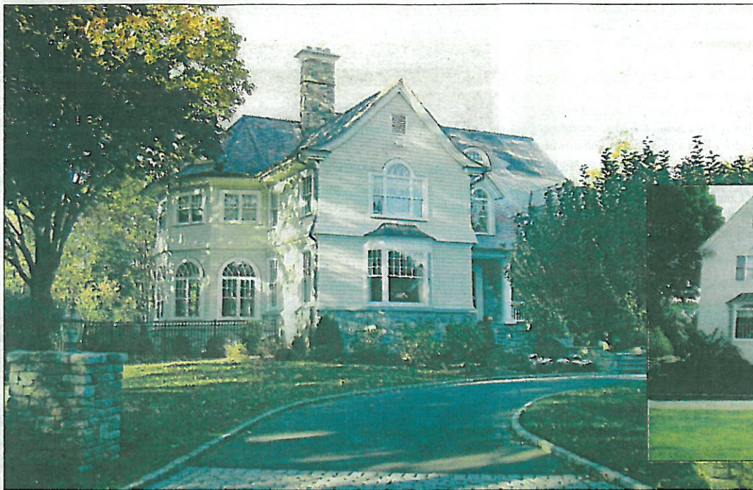
From a large but traditional Colonial, a Queen Anne evolved, with an arresting array of period details. What began as a kitchen makeover eventually included the entire house and the backyard, as well.