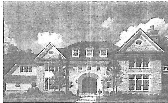
This property designed by R. S. Granoff Architects was named 'Best Spec Home: $5 - $6 Million.'