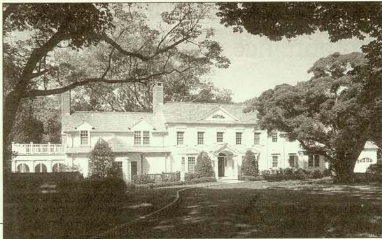
Two wings were added to this Greenwich home, and were blended in so beautifully that it was singled out as the Remodeled Home of the Year in 2003 by the homebuilders industry.

tion, working with Rink DuPont, AIA, Architects. The project took 14 to 16 months. Although the house went from 8,000 square feet to approximately 10,000 square feet, that hardly tells the tale. The main part of the house was deemed sound enough to keep, but the interiors were pretty much gutted. The living room with its fireplace, which was on the small side, was converted to a front foyer and a period stairway was added. Ceilings were raised, the room layout was changed, and the entire house was rewired and re-plumbed and a "smart house" system was installed. In addition, two wings were