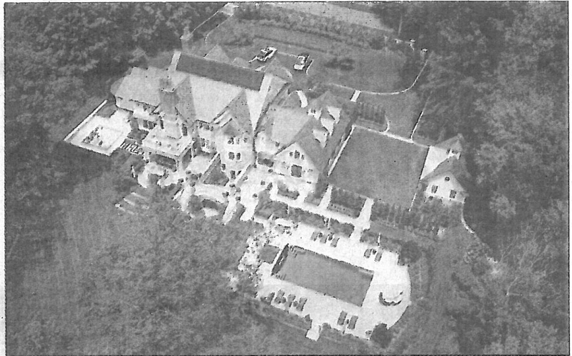
Hobbs, Inc., located on Grove Street, was awarded Fairfield County Project of the Year, for its work on the 10,000-square-foot luxury home pictured above. The awards are given out annually by the Home Builders Association of Connecticut. At right, the archstone bridge overlooks the cobblestone courtyard.

"When we started the house three years ago, 'green' was still relatively new to our marketplace so it was a great learning experience for us to research all these great products and seeing